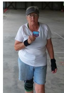
2023 League High Game over avg