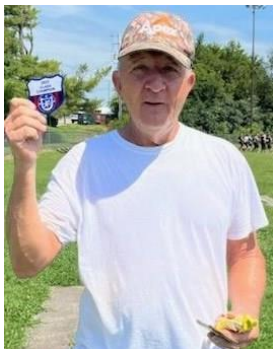
8-26-23 WP CLB Pinkston