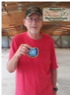
2023 League Champ