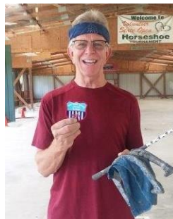
2023 League High Game