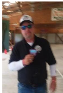
2023 League High AVG