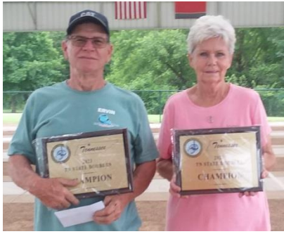
2023 TN Dbls Champs