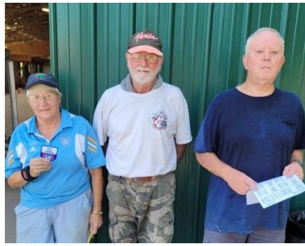
8-26-23 CRS CLB 1 st Stanford