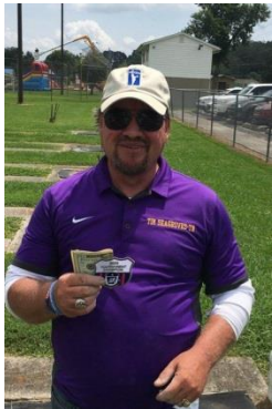
8-12-23 WP CLA Seagroves