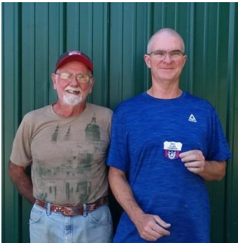
9-2-23 CRS CL B 1 st Pepper